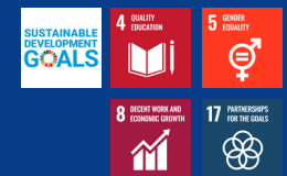
Our commitment to the UN SDGs

We protect and enable our employees, promoting growth and development for all, and driving actions to ensure a diverse workforce and an inclusive culture. This contributes to SDGs 4, 5 and 8. We also work to protect and support communities where we and our suppliers operate, including securing a responsible value chain that protects human and labour rights, further contributing to SDG 8.