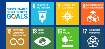
Our commitment to the UN SDGs

All three of our sustainability pillars share a common commitment to SDG 17: Partnership for the goals. We know that it is only by working together with our customers, suppliers and other stakeholders that we can lead the sustainability transformation and drive the most meaningful positive change.