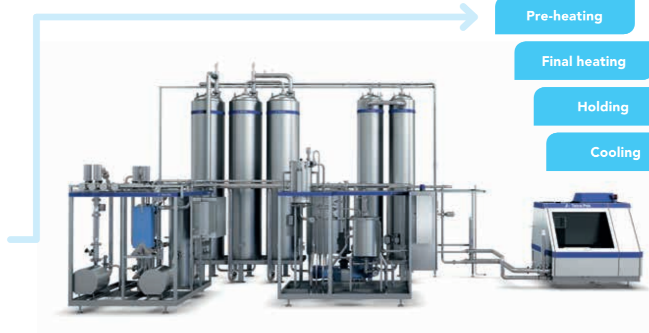
Tetra Therm Aseptic Visco with Tetra Vertico