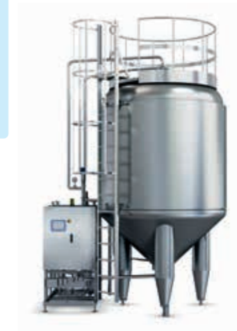
Aseptic storage Tetra Alsafe