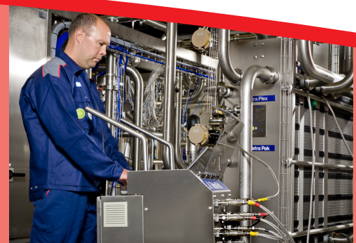
Tetra Pak has an unsurpassed global organization for service and support.