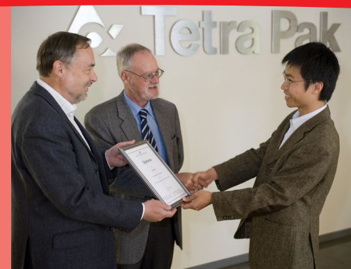
Knowledge and competence are effectively passed along and made available with ongoing training.

Welcome to the Tetra Pak world of heat transfer solutions.