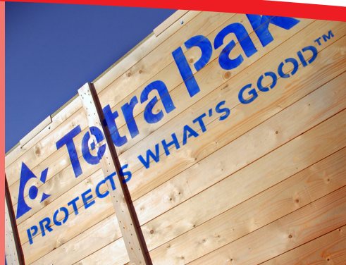
We understand the importance of taking good care of a trademark. Yours and our own.